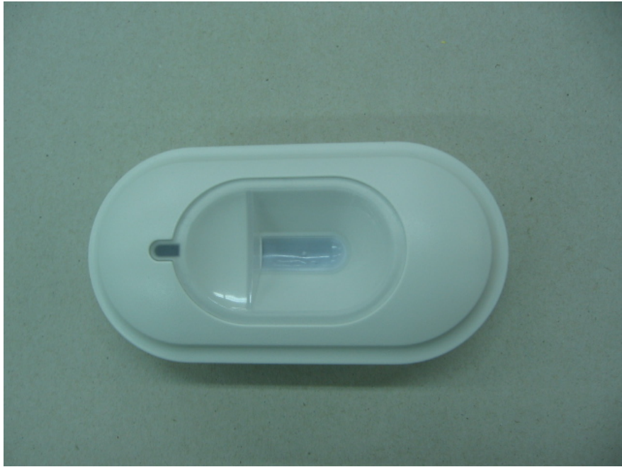
Figure 1: Top of Unit