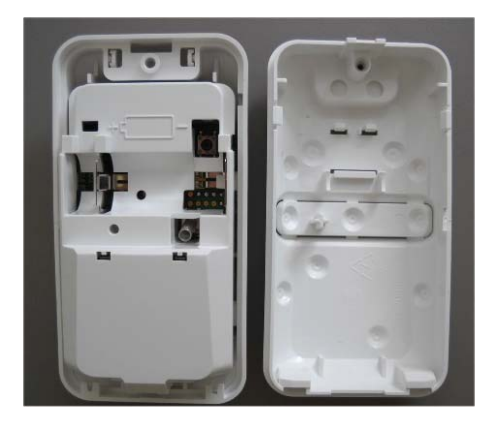
Photograph No.1 "Tower-30 AM PG2" PIR detector internal view