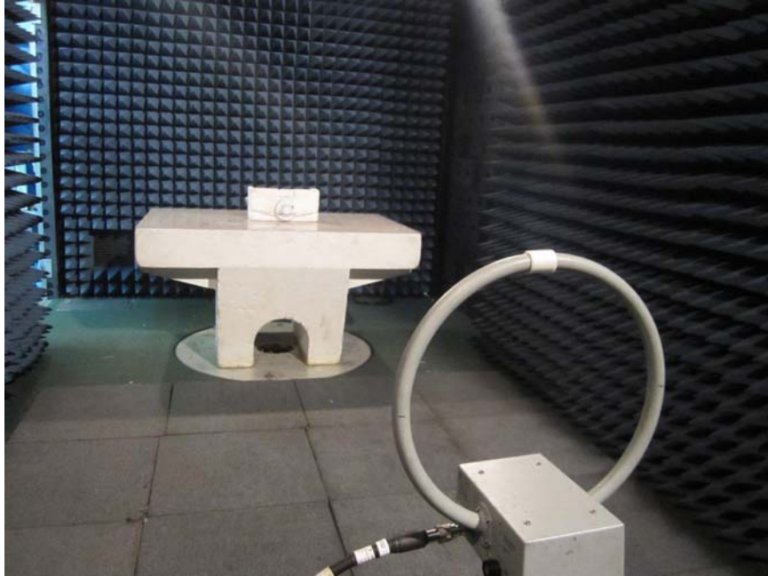
Photograph No.1 Setup for spurious emission field strength measurements in the anechoic chamber below 30 MHz