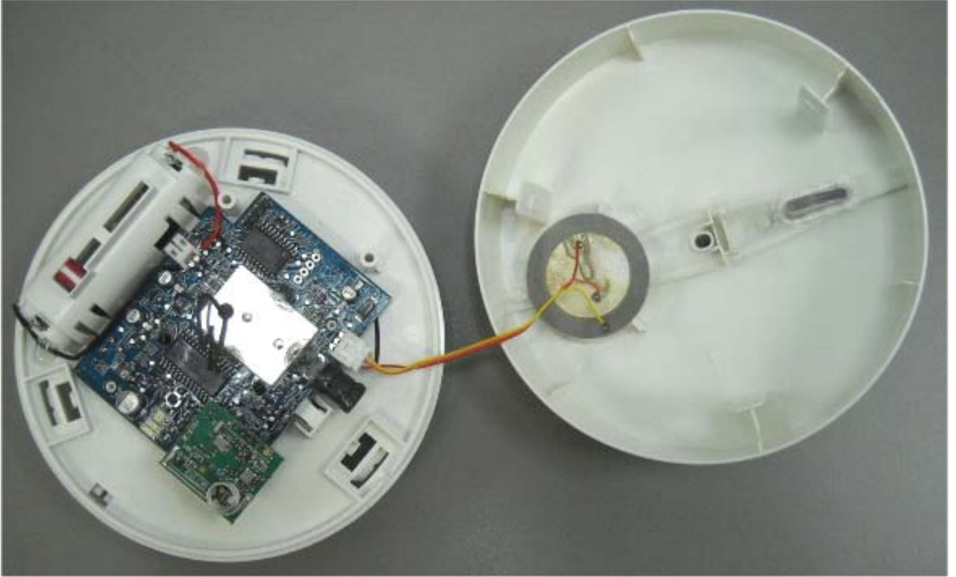
Photograph No.1 Smoke detector internal view