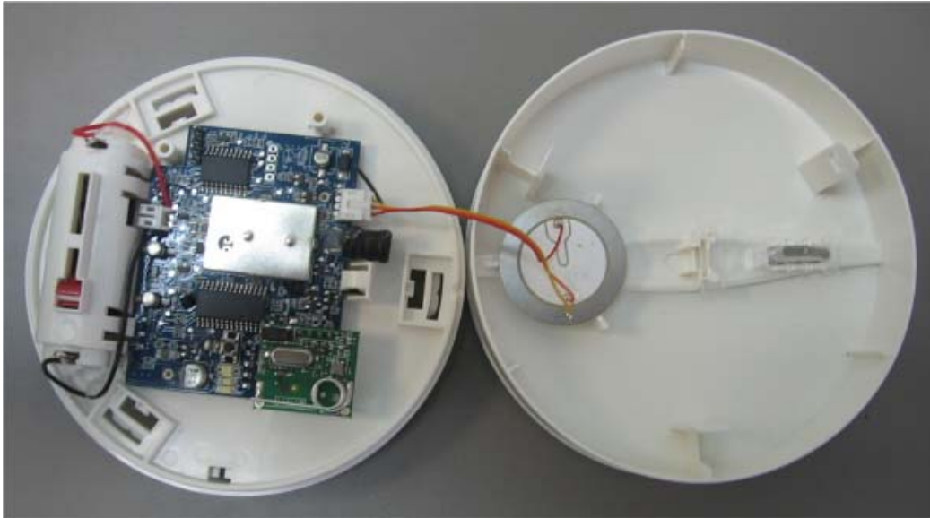
Photograph No.1 SMD-426 detector internal view