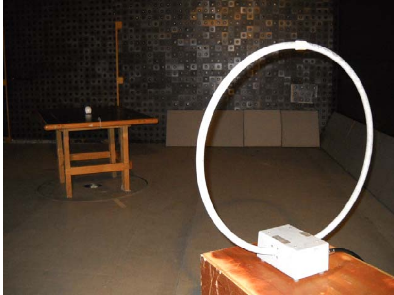
Photograph No.1 Setup for spurious emission field strength measurements in the anechoic chamber below 30 MHz