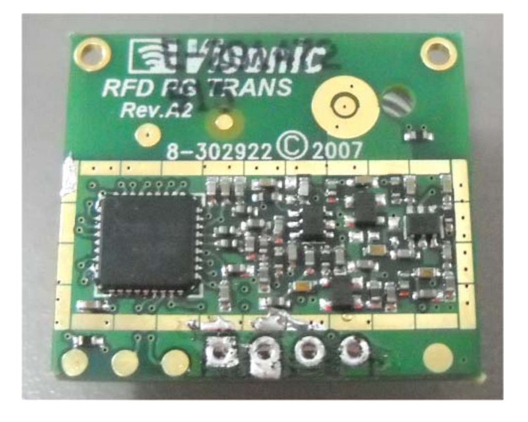
Photograph No.7 RFD module PCB second side view