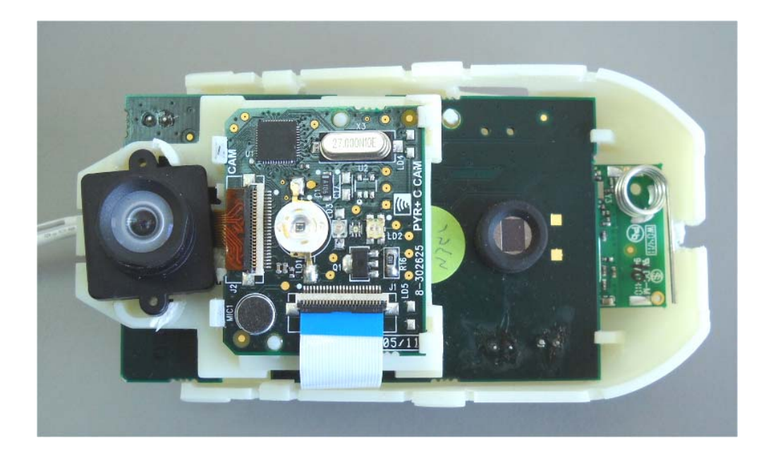
Photograph No.2 Digital PIR detector with camera internal view