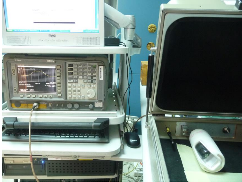
Photograph No.1 Setup for OBW measurements