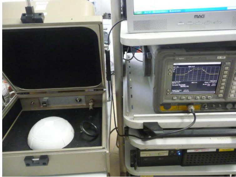
Photograph No.1 Setup for OBW measurements