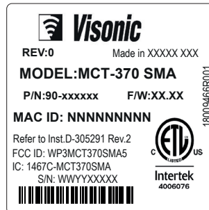
Label shown is 200% of actual size