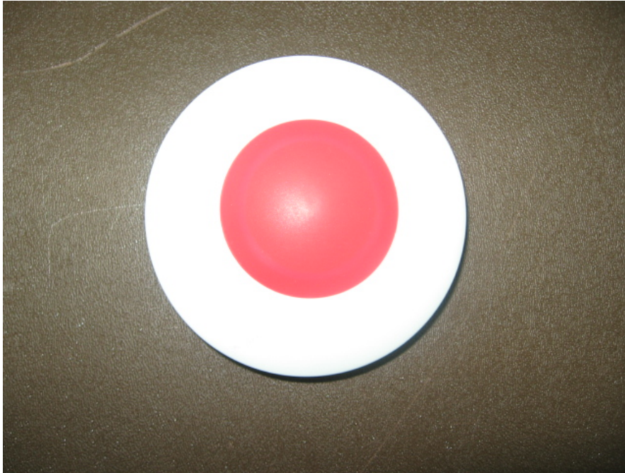
Figure 1: Top of Unit