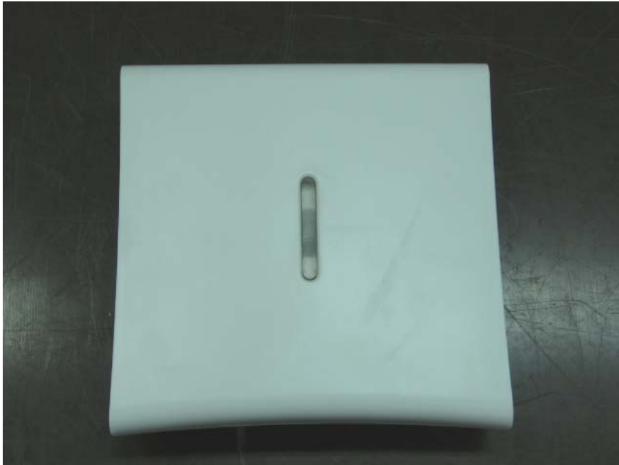
Figure 1: Top of Unit