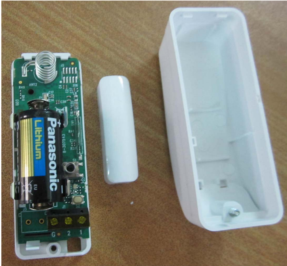
Photograph No.1 MC-309 PG2 magnetic contact internal view