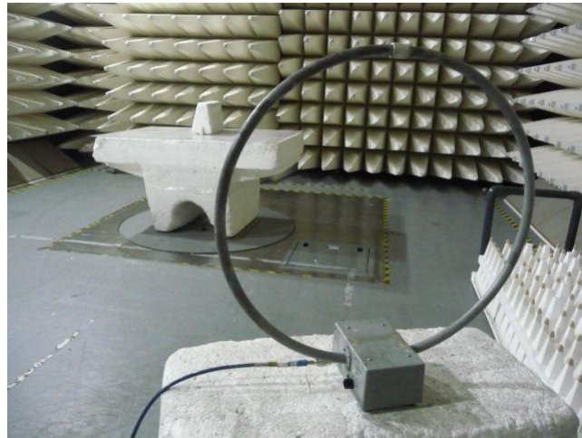
Photograph No.1 Setup for spurious field strength measurements in anechoic chamber from 9 kHz to 30 MHz