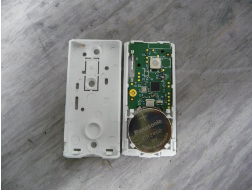
Photograph No.1 Wireless magnetic contact MC-303 PG2 Internal view