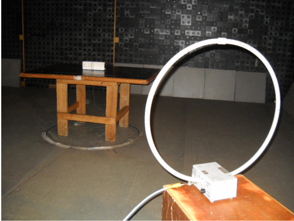
Photograph No.1 Setup for spurious emission field strength measurements in the anechoic chamber below 30 MHz