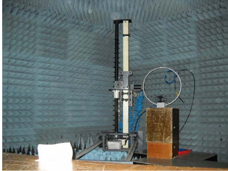
Photograph No.1 Setup for spurious emission field strength measurements in the anechoic chamber below 30 MHz