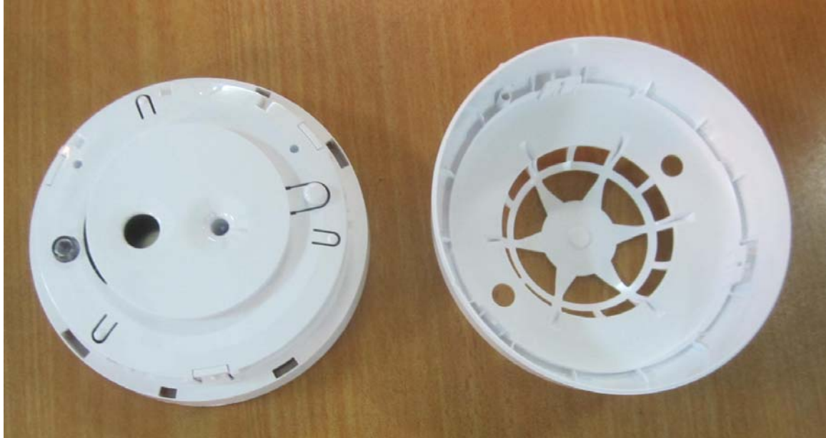
Photograph No.1 Heat detector internal view