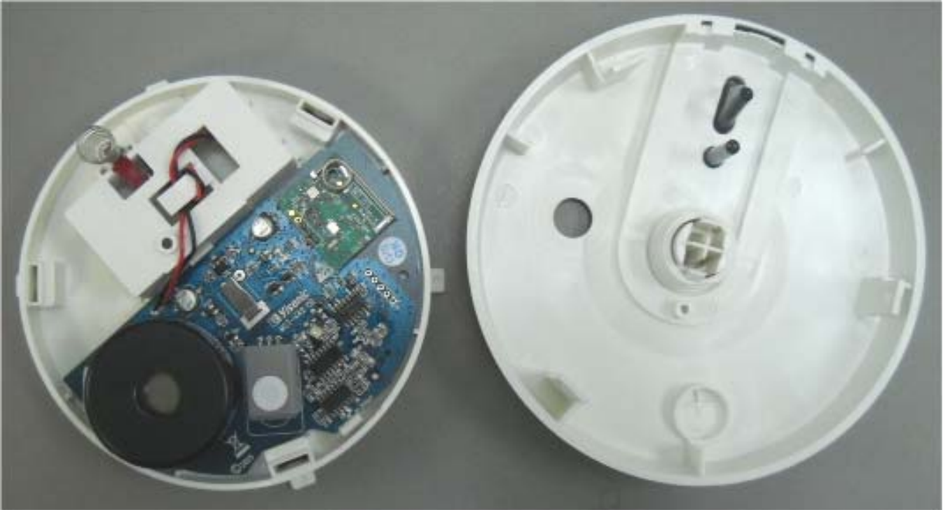
Photograph No.1 CO gas detector internal view