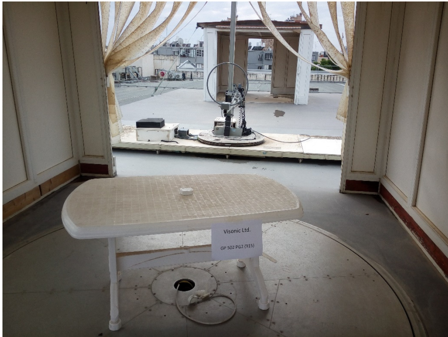
Figure 1. Radiated Emission Test – Ceiling Mounted