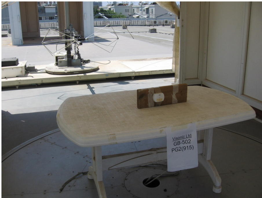
Figure 6. Radiated Emission Test – Wall Mounted