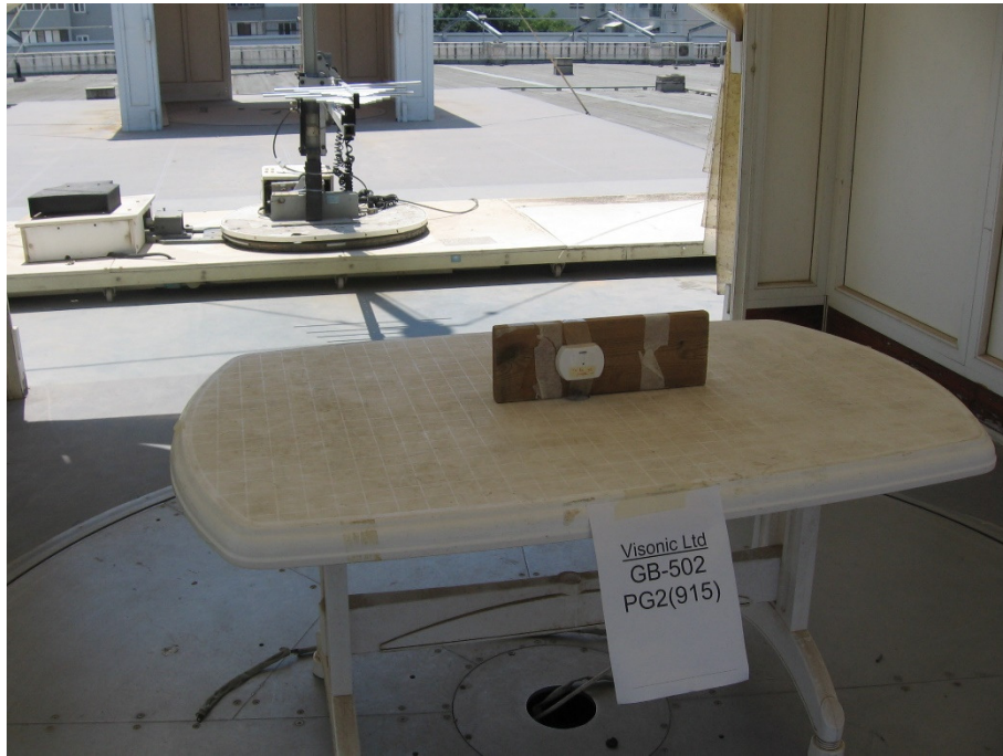
Figure 5. Radiated Emission Test – Wall Mounted