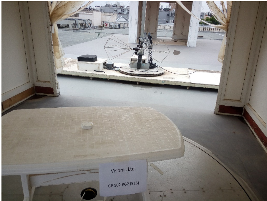
Figure 2. Radiated Emission Test – Ceiling Mounted