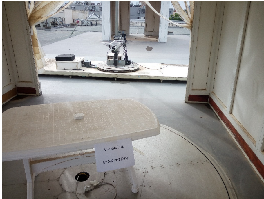
Figure 3. Radiated Emission Test – Ceiling Mounted