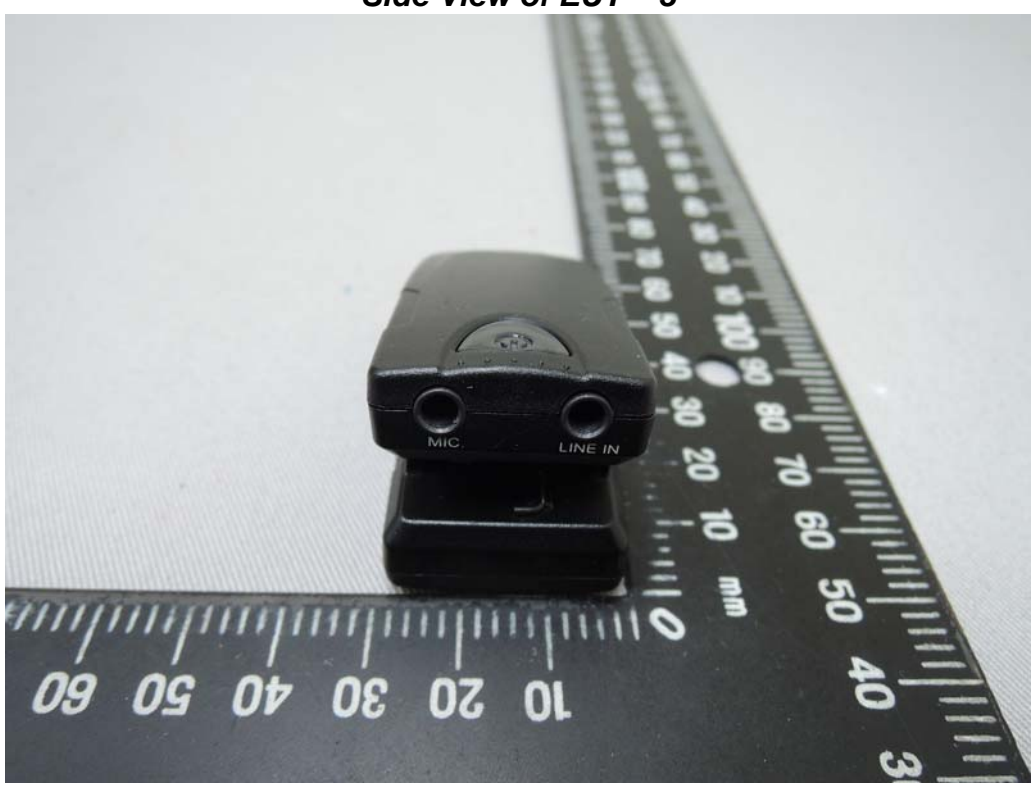
Side View of EUT - 4