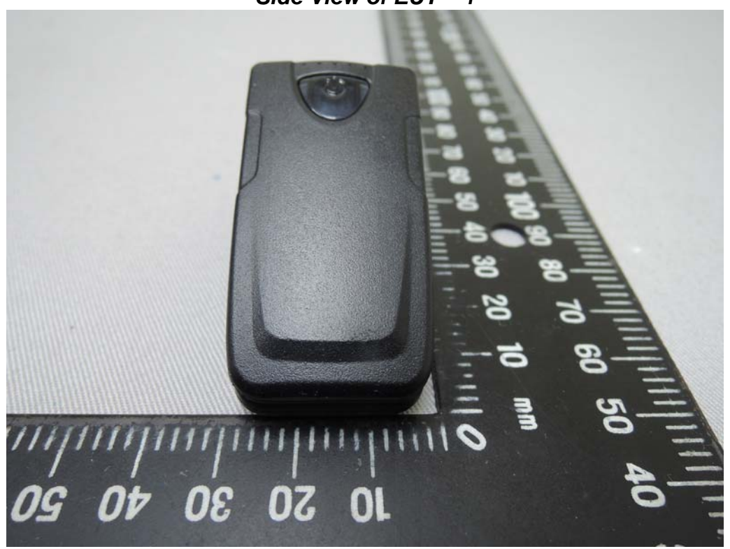
Side View of EUT - 2