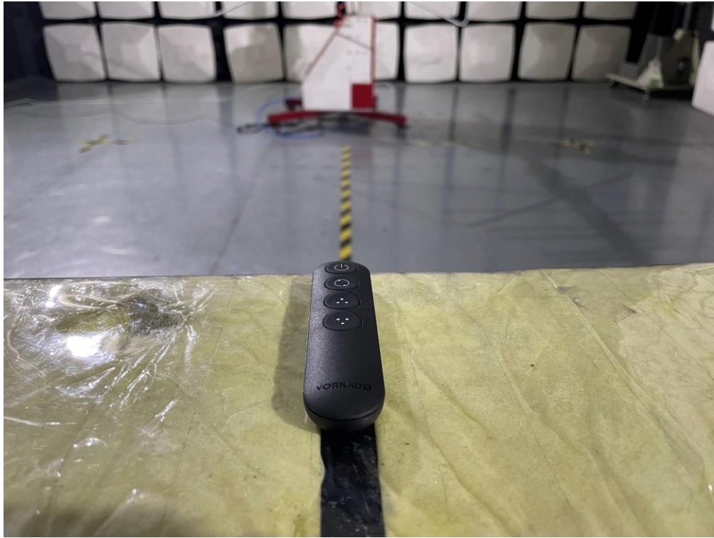
Radiated emission (Above 1000MHz)