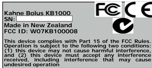
KB1000 Series bolus FCC label (polycarbonate material)