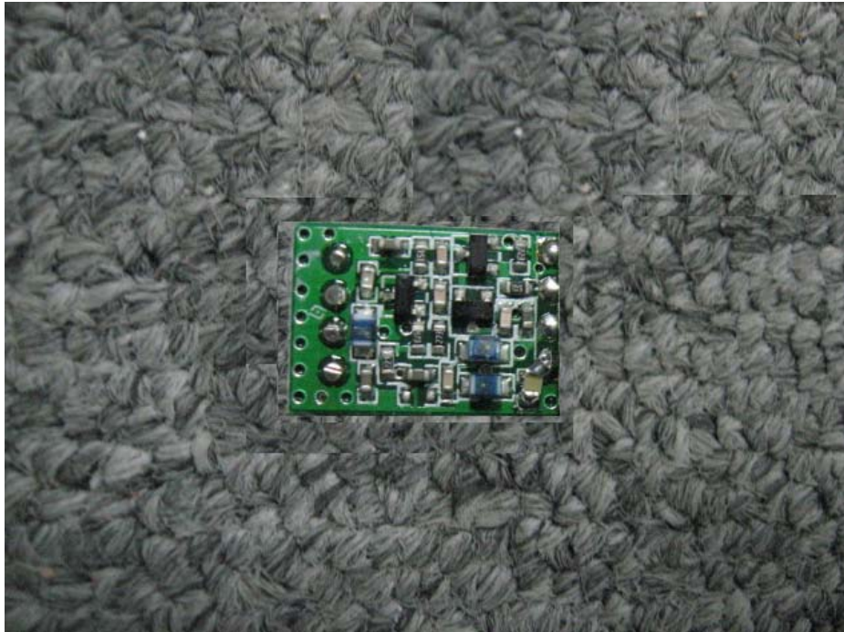
RF Module View#1