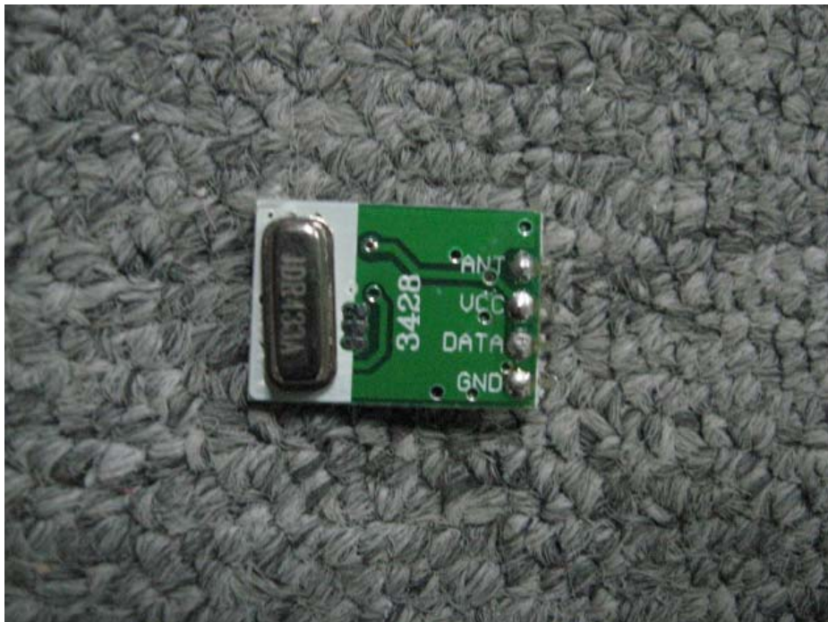
RF Module View