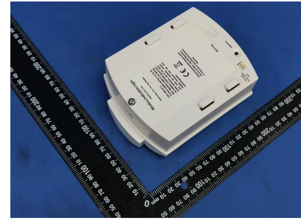
Description: Rear view