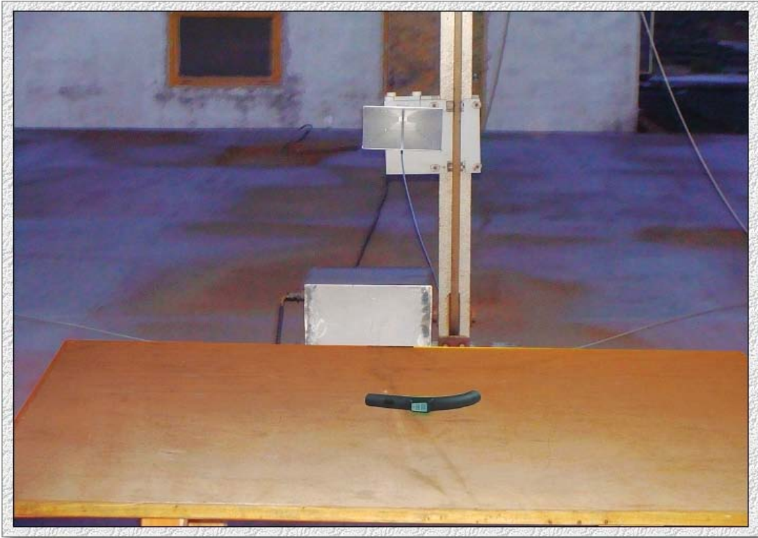
DSC-H10 F4.0 1/8s ISO800

The report refers only to the sample tested and does not apply to the bulk. This report is issued in confidence to the client and it will be strictly treated as such by the Shenzhen Timeway Technology Consulting Co., Ltd. It may not be reproduced in its entirety or in part and it may not be used for advertising. The client to whom the report is issued may, however, show or send it, or a certified copy thereof prepared by the Shenzhen Timeway Technology Consulting Co., Ltd. to his customer, supplier or other persons directly concerned. Shenzhen Timeway Technology Consulting Co., Ltd. will not, without the consent of the client, enter into any discussion of correspondence with any third party concerning the contents of the report. In the event of the improper use of the report, the Shenzhen Timeway Technology Consulting Co., Ltd. reserves the rights to withdraw it and to adopt any other remedies which may be appropriate.