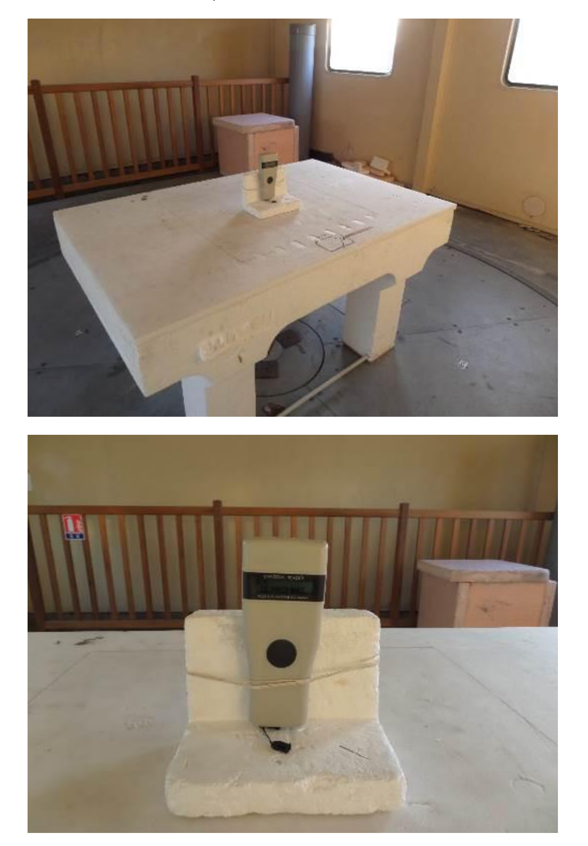
Open Area Test Site – TX mode