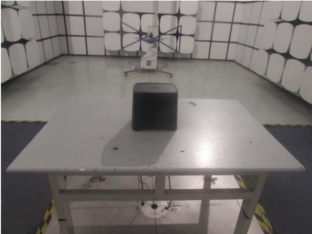
Radiated Test (1000-25000 MHz)