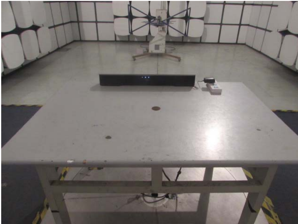
Radiated Test (1000-25000 MHz)