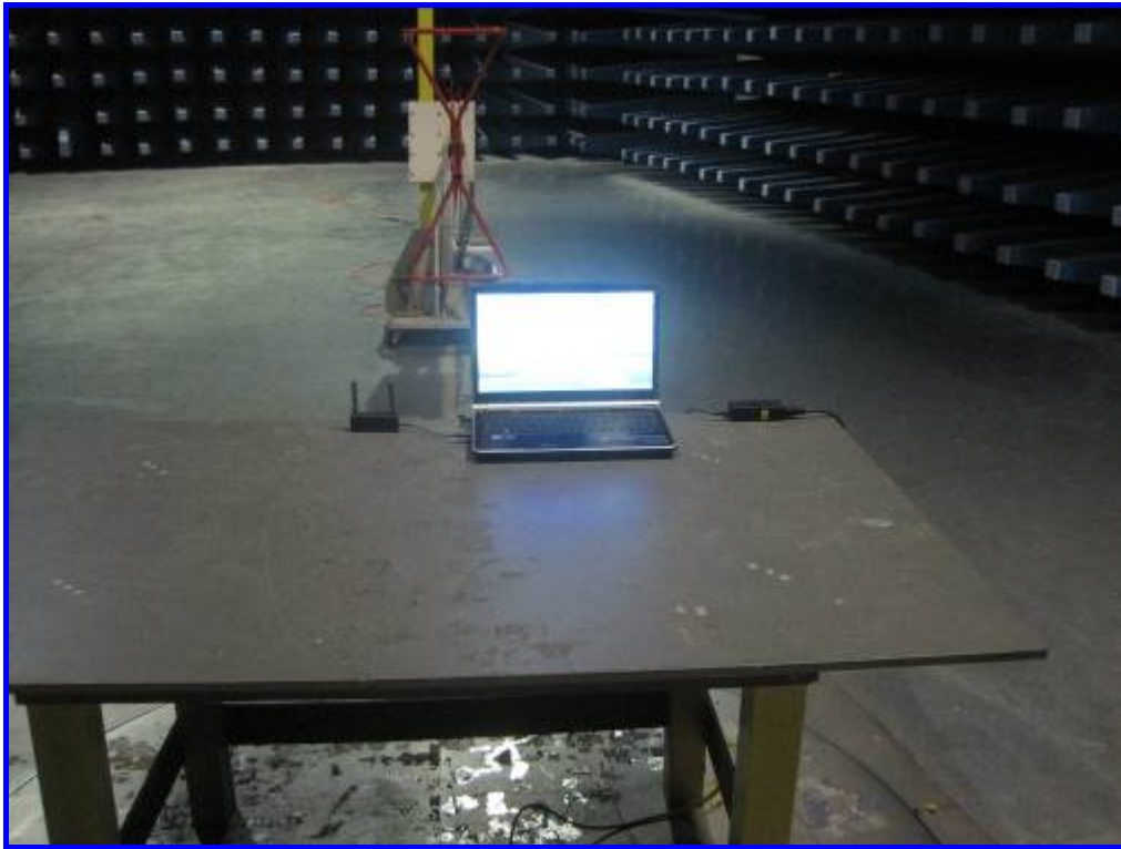
Radiated Emission Test Setup Front View below 1GHz

Serial#: 1005020-FCC 15.247 Issue Date: 26 November 2010 Page: 119 of 135 www.siemic.com.cn