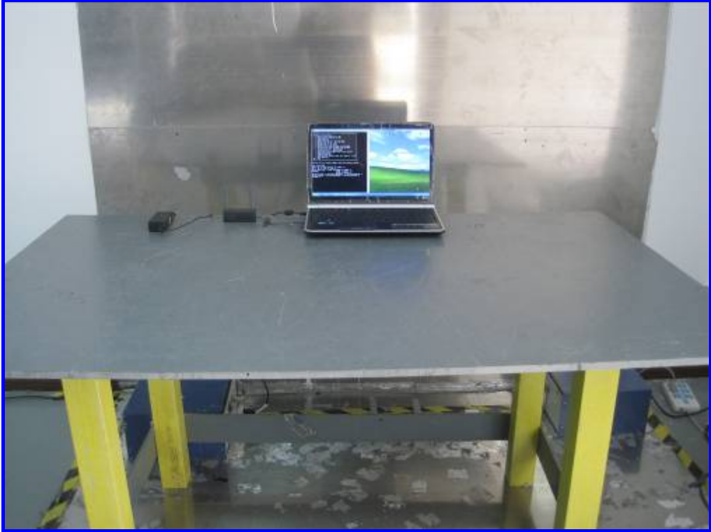
Conducted Emission Test Setup Front View