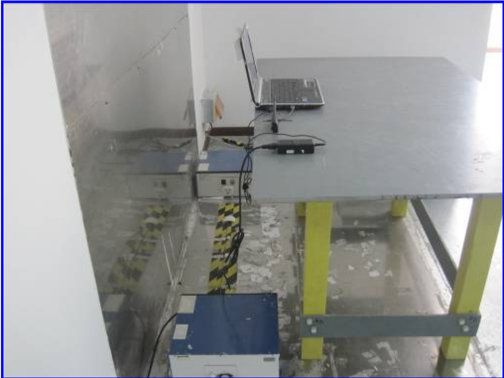
Conducted Emission Test Setup Side View