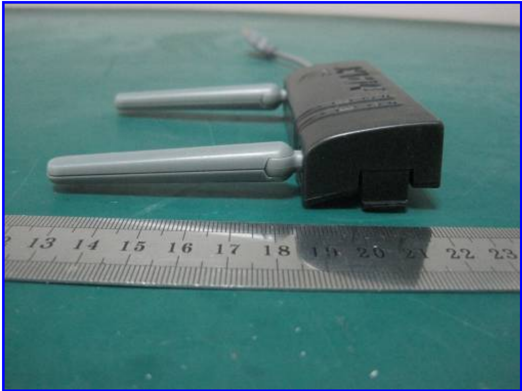
Left View of EUT