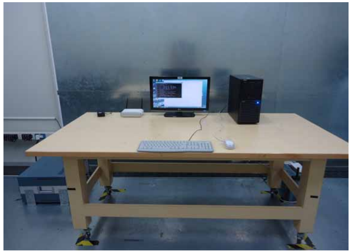
FRONT VIEW OF CONDUCTED MEASUREMENT