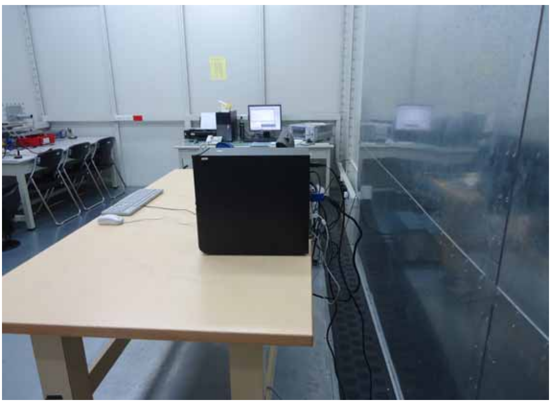
BACK VIEW OF CONDUCTED MEASUREMENT