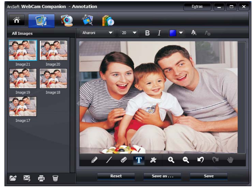
You can use this function to make some changes on the photos taken either by adding some word or change background or erasing any portion that you would like to delete.