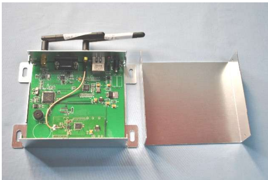
Main&RF board component side