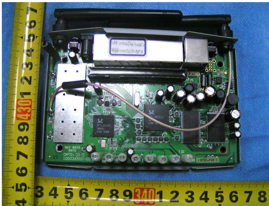
Main Board Front View