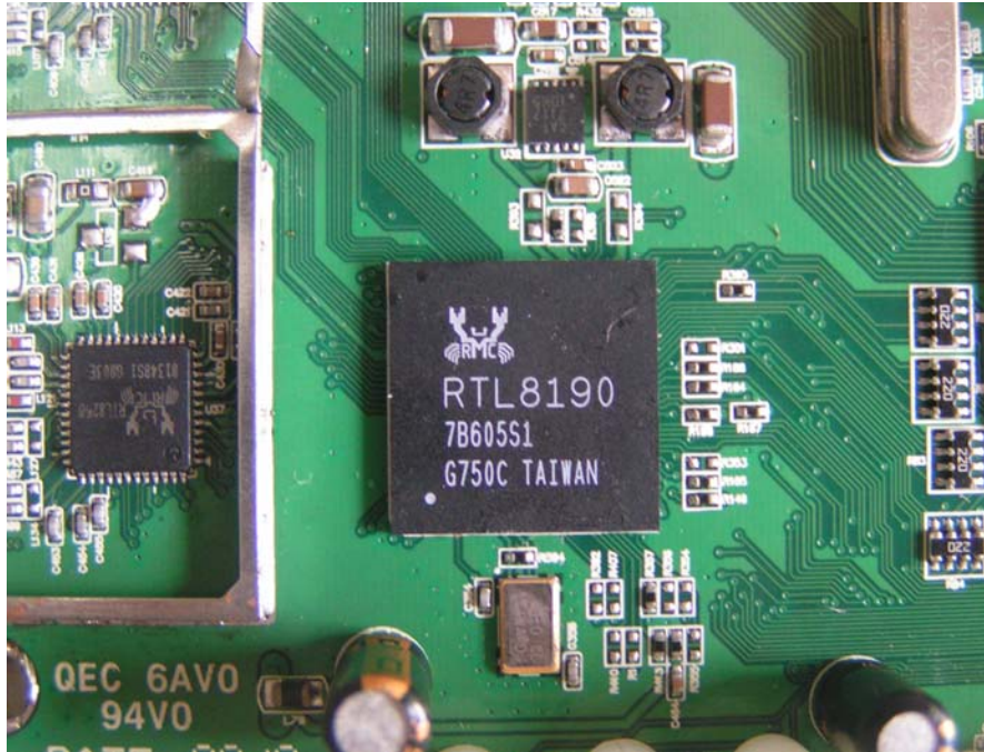
Chip #1 View