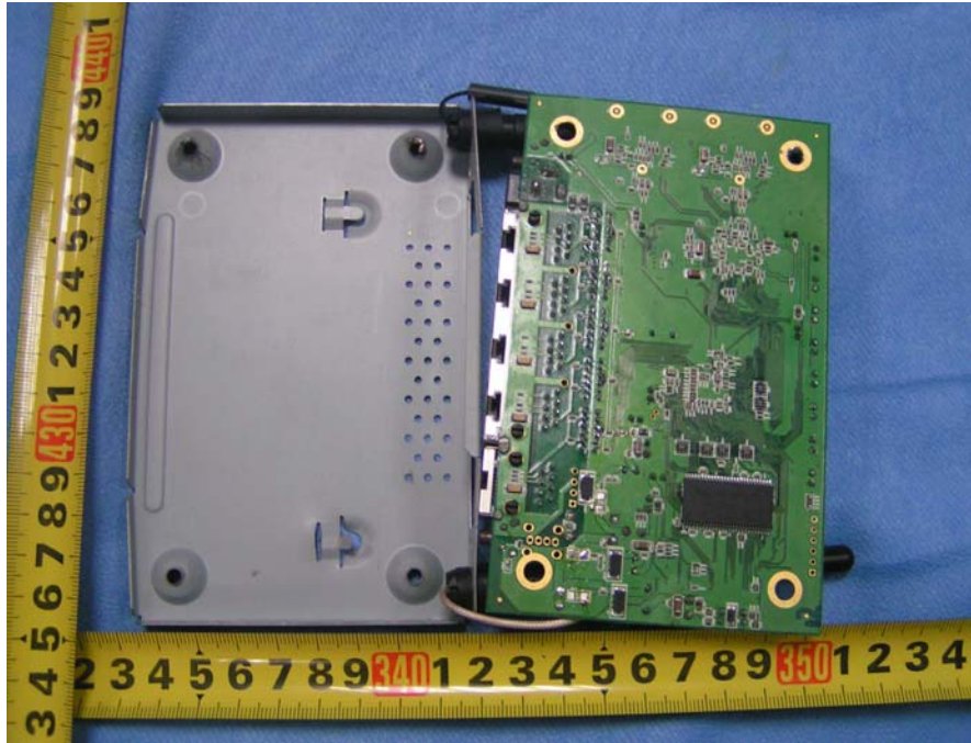
Main Board Rear View