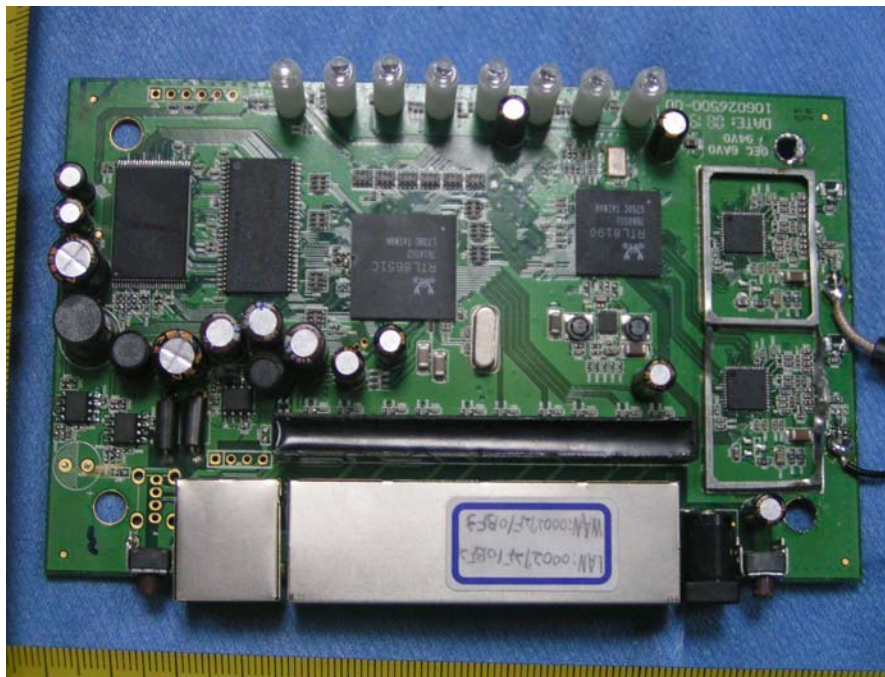
Main Board Shielded Uncovered View