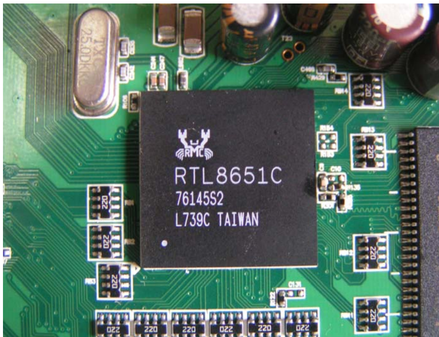
Chip #2 View