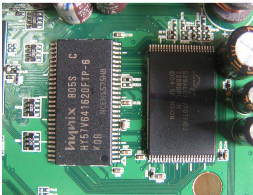
Ram Chip View