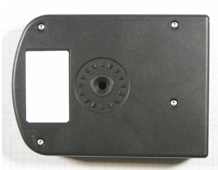
Figure 2: Cover B (bottom view)