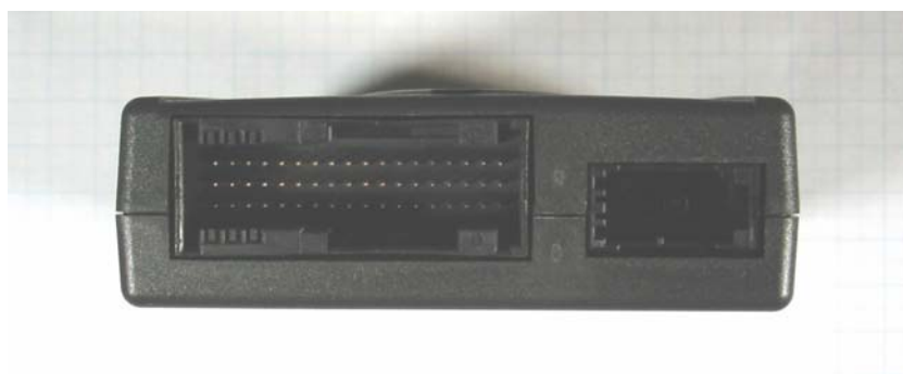
Figure 3: Connection panel (front view)