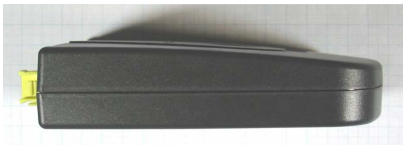
Figure 4: side view