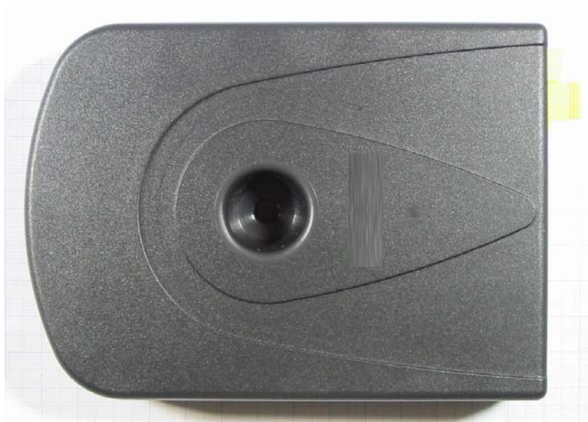
Figure 1: Cover A (top view)