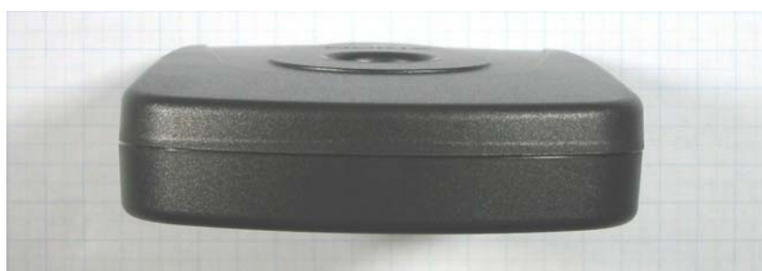
Figure 5: backside view