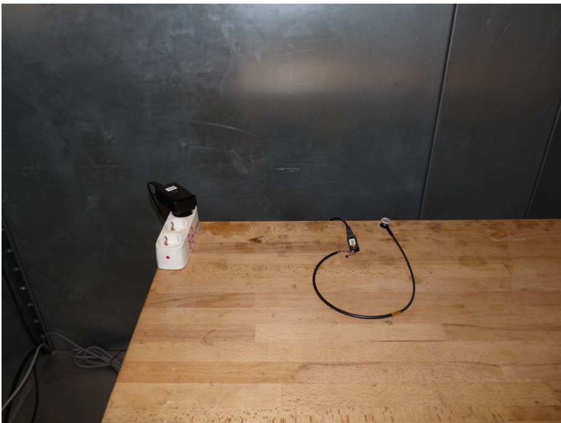
Photo 4: Test setup for conducted measurements (AC Port (power line))