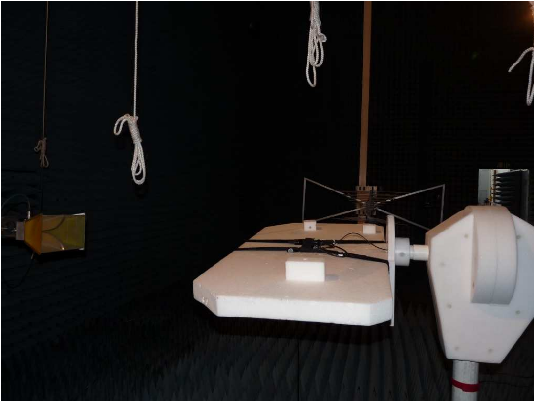
Photo 3: Test setup for radiated measurements (Enclosure, above 1 GHz)