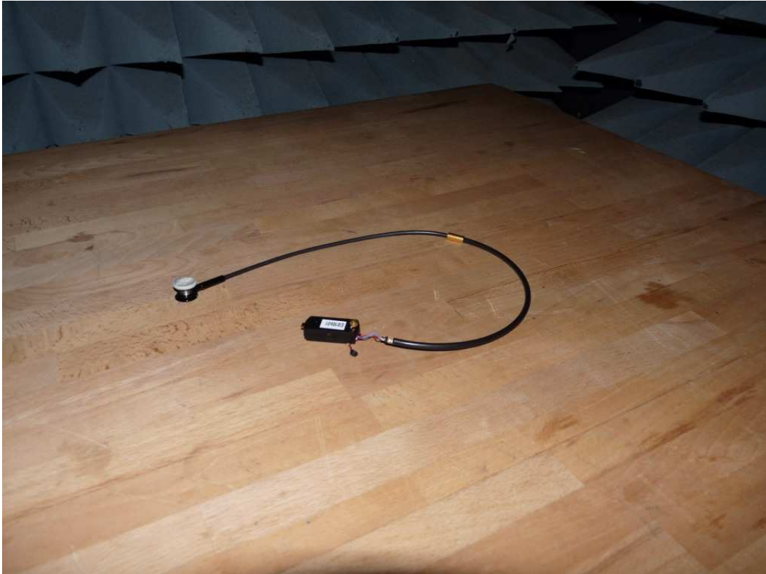
Photo 1: Test setup for radiated measurements (Enclosure, below 30 MHz)