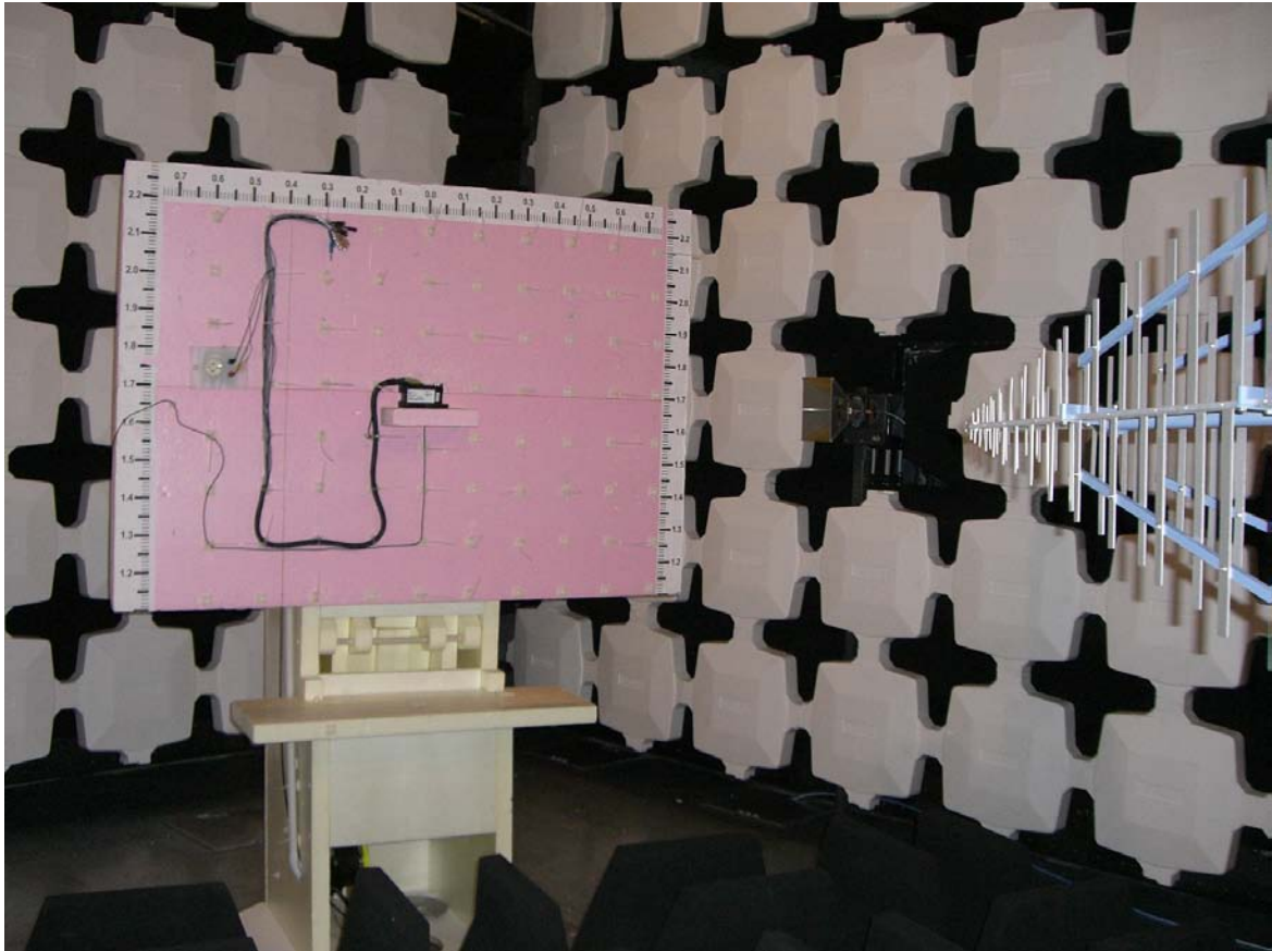
FCC Part 22/24/27 Spurious Emissions / FCC Part 15B Radiated Emissions >1GHz