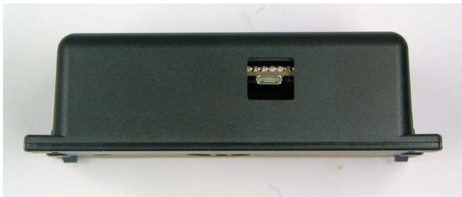
Side view with USB connector (only used for internal R&D purposes, in the final product the USB connector is not assembled)