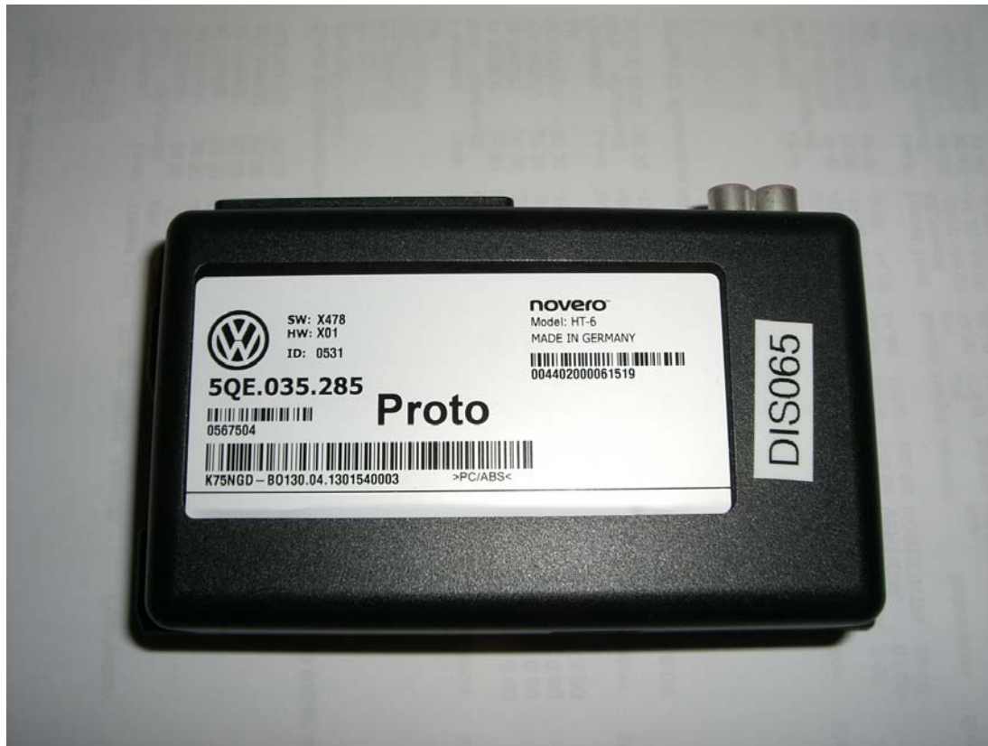
Top View with type label