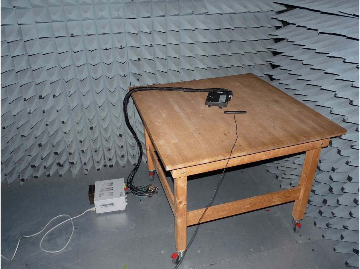
Photo 1: Test setup for radiated measurements (Enclosure, below 30 MHz)

Detailed photos of the OUT are declared as confidential.