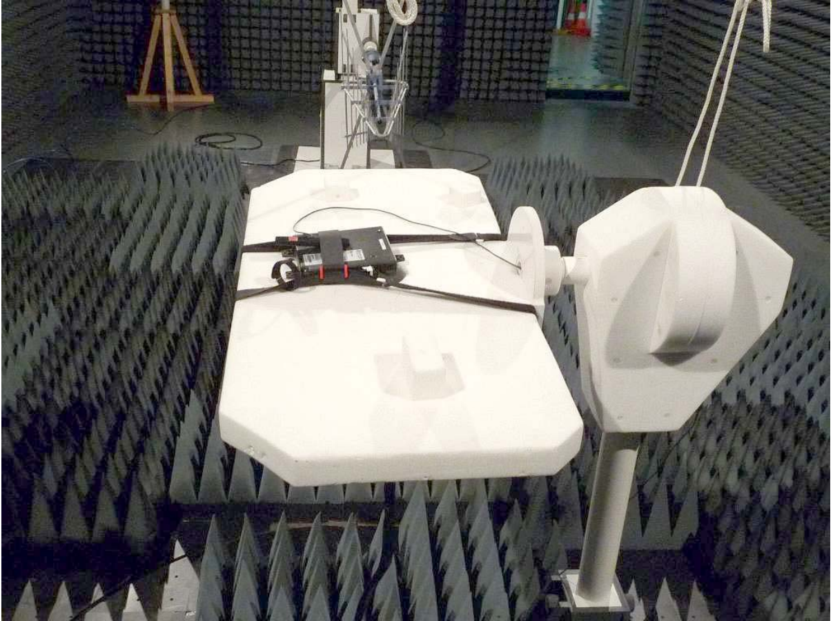
Photo 4: Test setup for radiated measurements (Enclosure, above 1 GHz)