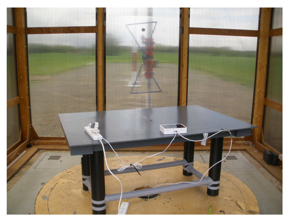
Photograph 4 Radiated Emissions - Flat - Back