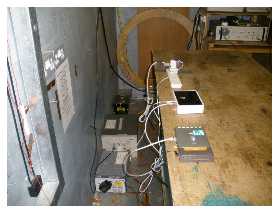
Photograph 2 Conducted Emissions - Back