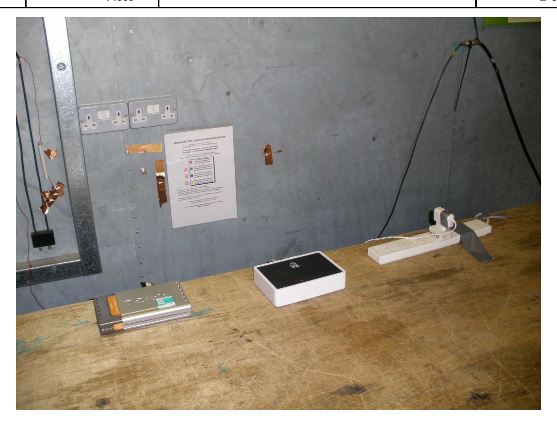
Photograph 1 Conducted Emissions - Front