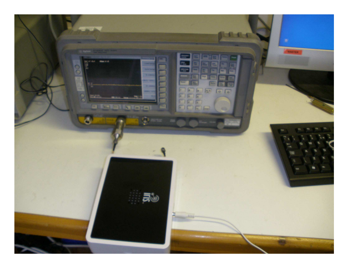
Photograph 5 Conducted Antenna