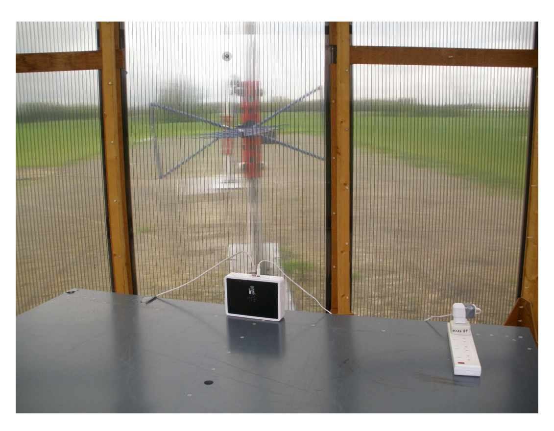
Photograph 3 Radiated Emissions - Upright - Front