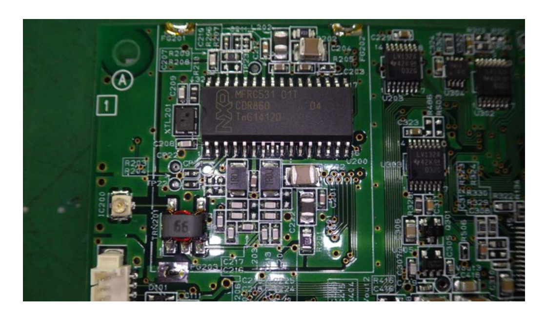
RF driver IC block