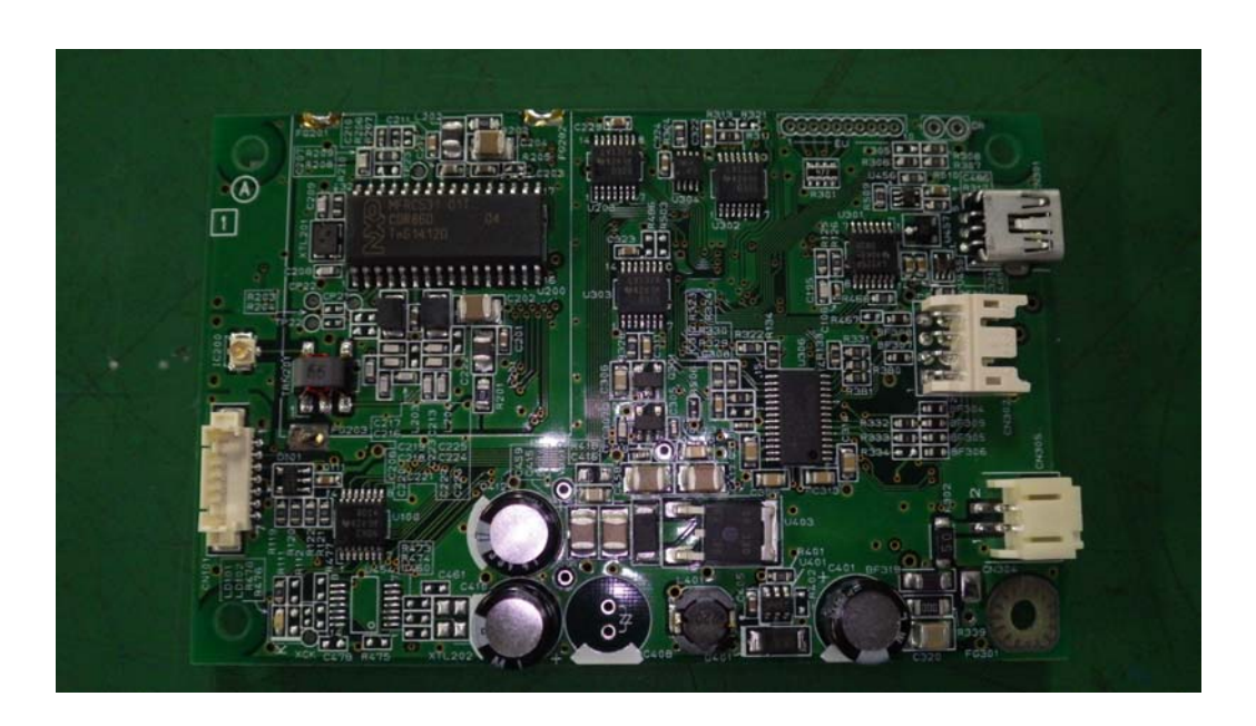
RF module with not shield