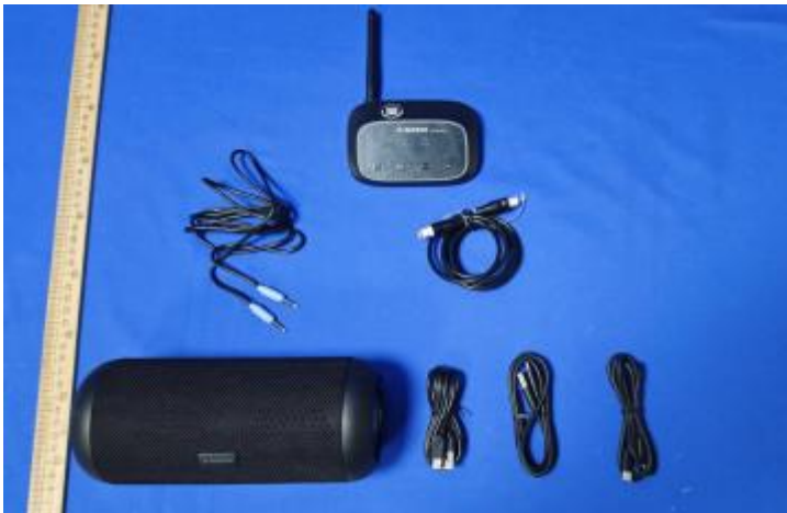
WSSP-008: No transmitter

Model No.:WSSP-008,WSSP-5308 WSSP-5308: Transmitter with 500P2