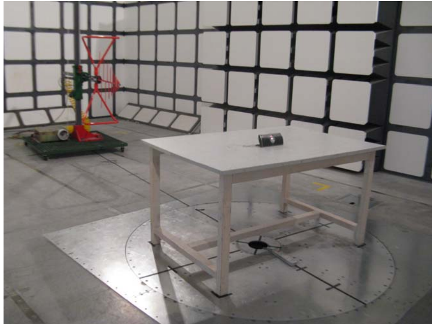
Radiated Emissions - Rear View (battery power below 1GHz)