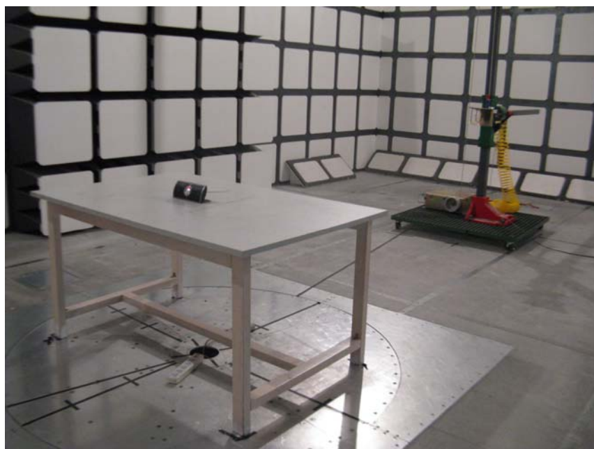
Radiated Emissions - Rear View (above 1GHz)