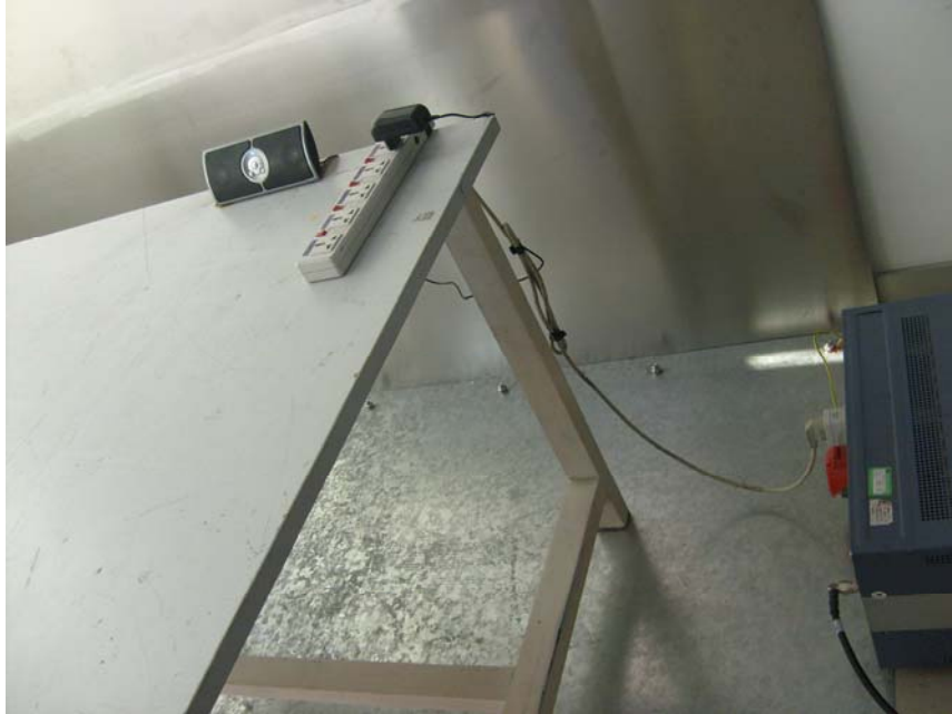
Conducted Emissions - Rear View (Adapter power)