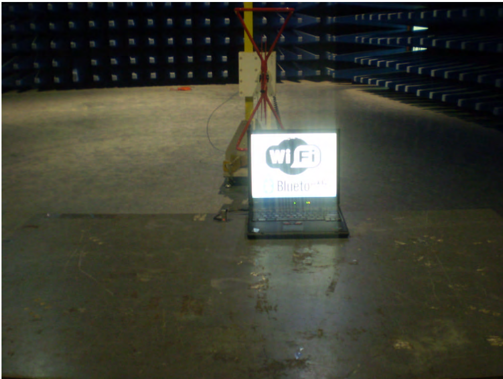
Radiated Spurious Emissions Test Setup (30MHz-1GHz)

Serial#: 1002074 Issue Date: February 08 2010 Page 32 of 49 www.siemec.com.cn