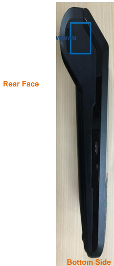
<EUT Left Side View>