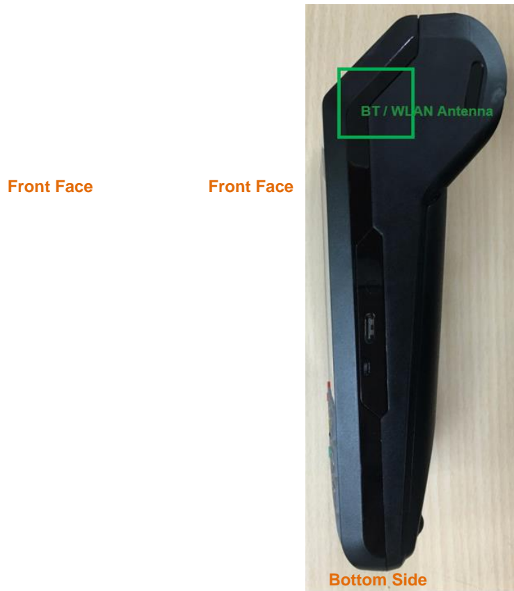
<EUT Right Side View>