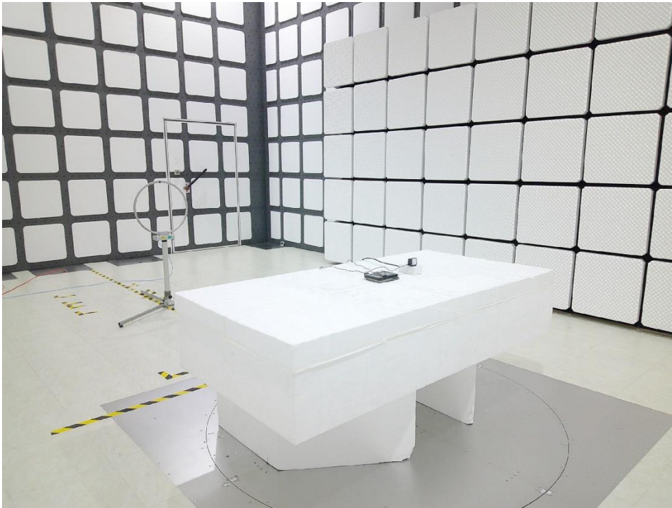
Description: Radiated Emission Test Setup for 30MHz ~ 1GHz