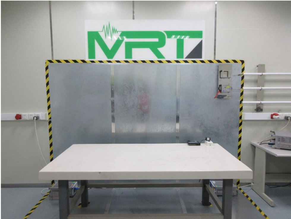
Description: Back View of Conducted Emission Test Setup