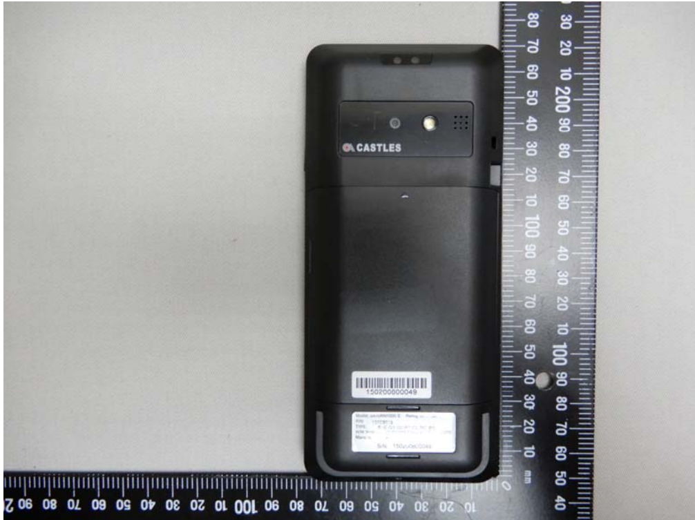
Side View of EUT – 1