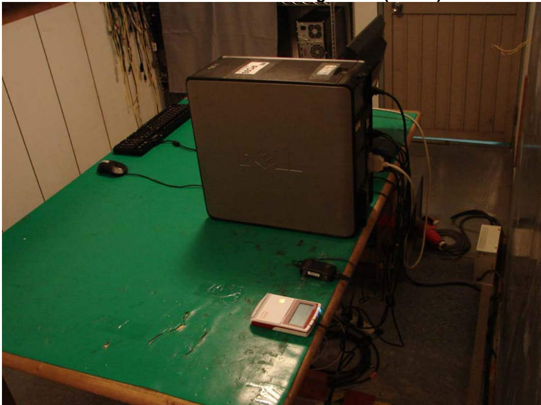
Rear View of The Test Configuration (RS232)