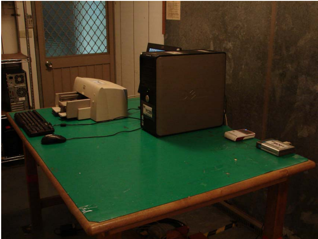
Front View of The Test Configuration (USB)