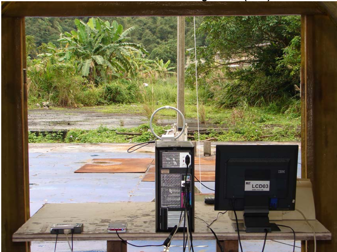
Rear View of The Test Configuration (USB)