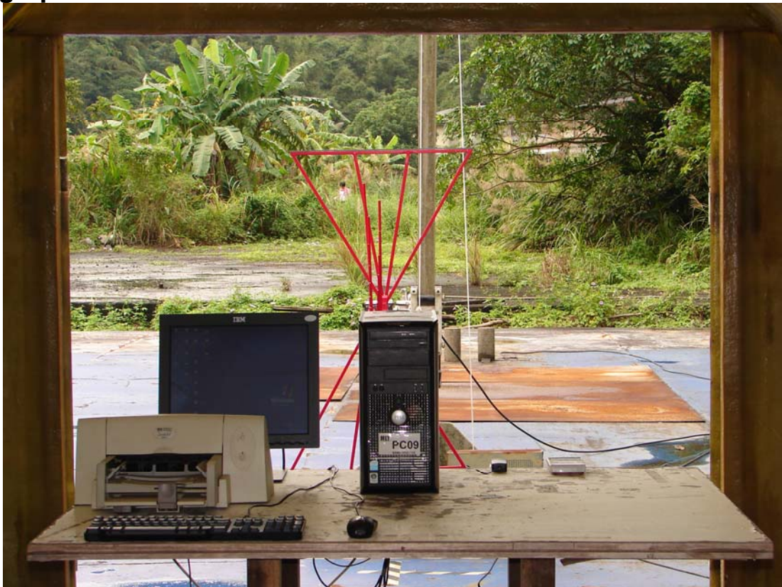
Front View of The Test Configuration (RS232)