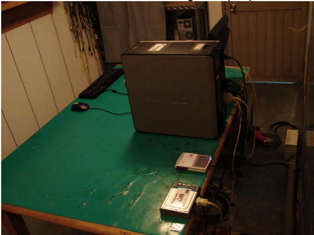
Rear View of The Test Configuration (USB)