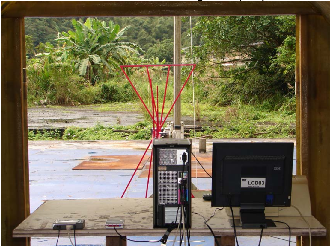
Rear View of The Test Configuration (USB)