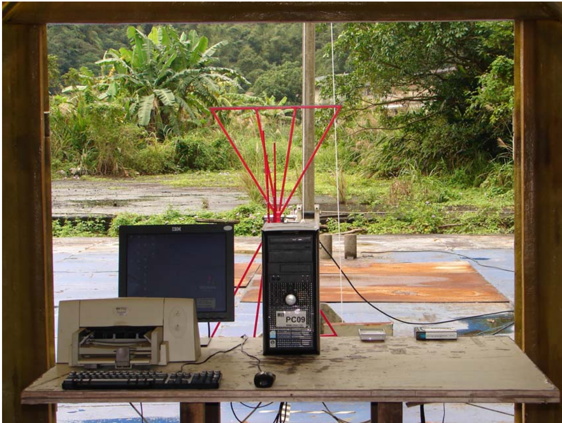
Front View of The Test Configuration (USB)