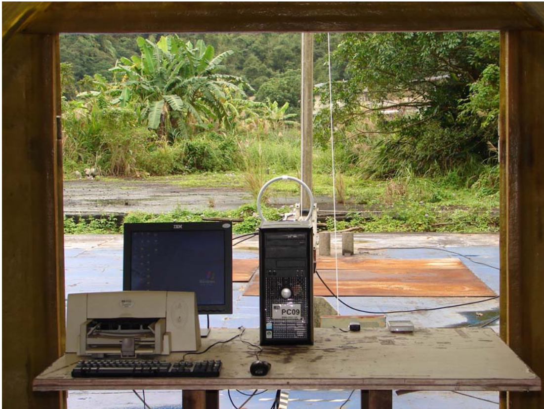
Front View of The Test Configuration (RS232)