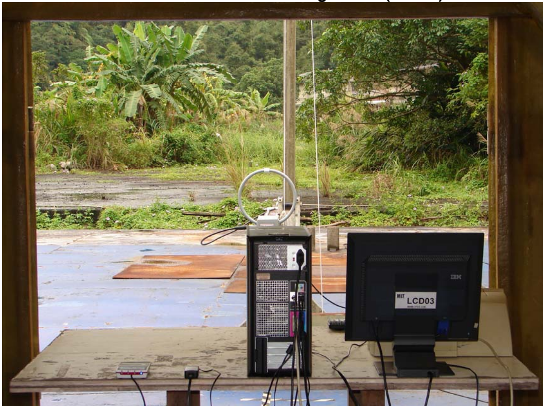
Rear View of The Test Configuration (RS232)