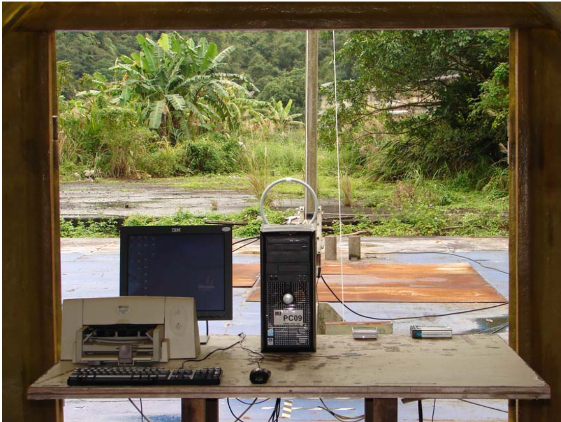
Front View of The Test Configuration (USB)