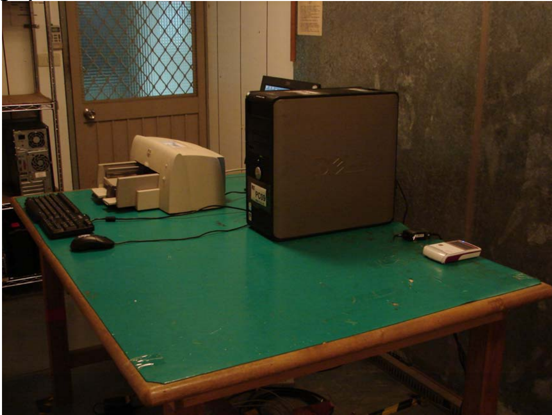
Front View of The Test Configuration (RS232)