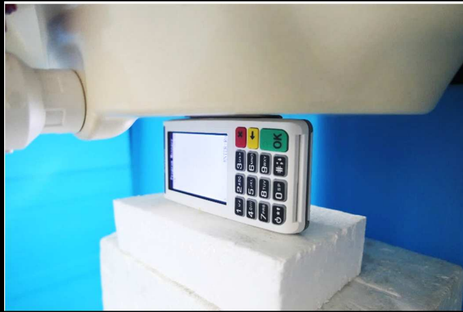
Right Side of EUT Tested at 0 mm