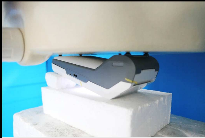
Rear Face of EUT Tested at 0 mm