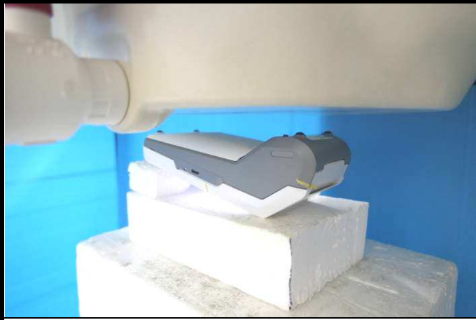
Rear Face of EUT Tested at 15 mm