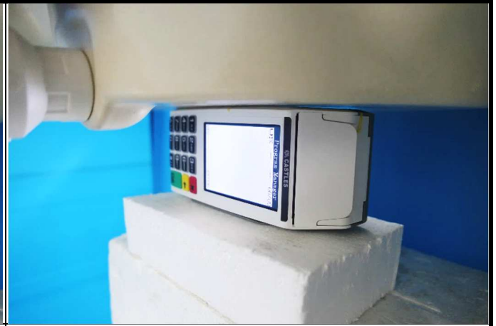
Left Side of EUT Tested at 0 mm